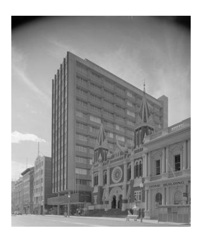
ANZ Bank Building 84 St Georges Terrace, Perth